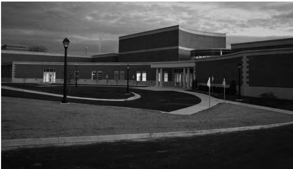
The Covington Center for Visual and Performing Arts opened in Fall 2008. This state-of-the-art facility houses the Galley at the Covington Center, rehearsal rooms and a 300-seat performance hall.

The Radford University Graduate Catalog is the basic authority for academic requirements at Radford University. All students are expected to follow the catalog in the pursuit of their degrees. On rare occasions, extraordinary circumstances may, however, justify minor departures from the catalog requirements. A graduate student who needs to petition for an exception to academic policy must complete the Graduate Student Academic Petition form in consultation with his/her adviser, available in the Graduate College office and submit to the Graduate College.