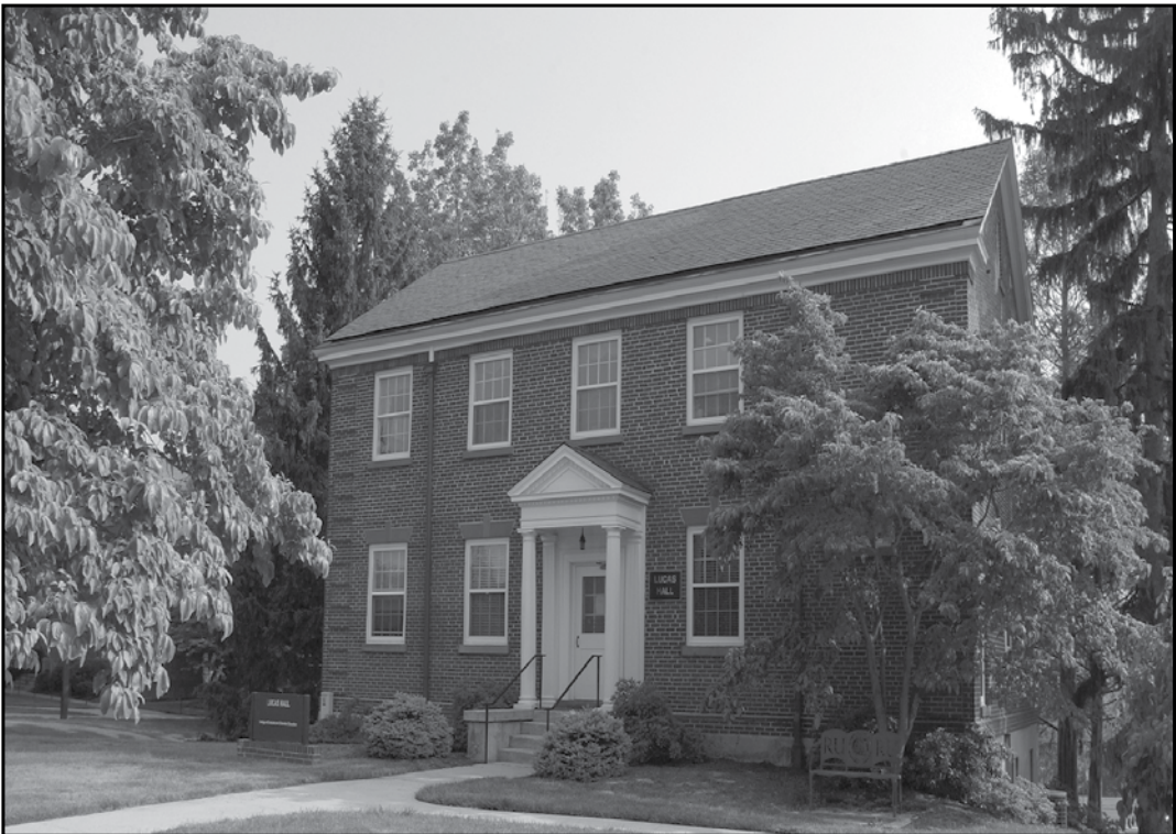
The College of Graduate and Professional Studies is located in Lucas Hall.