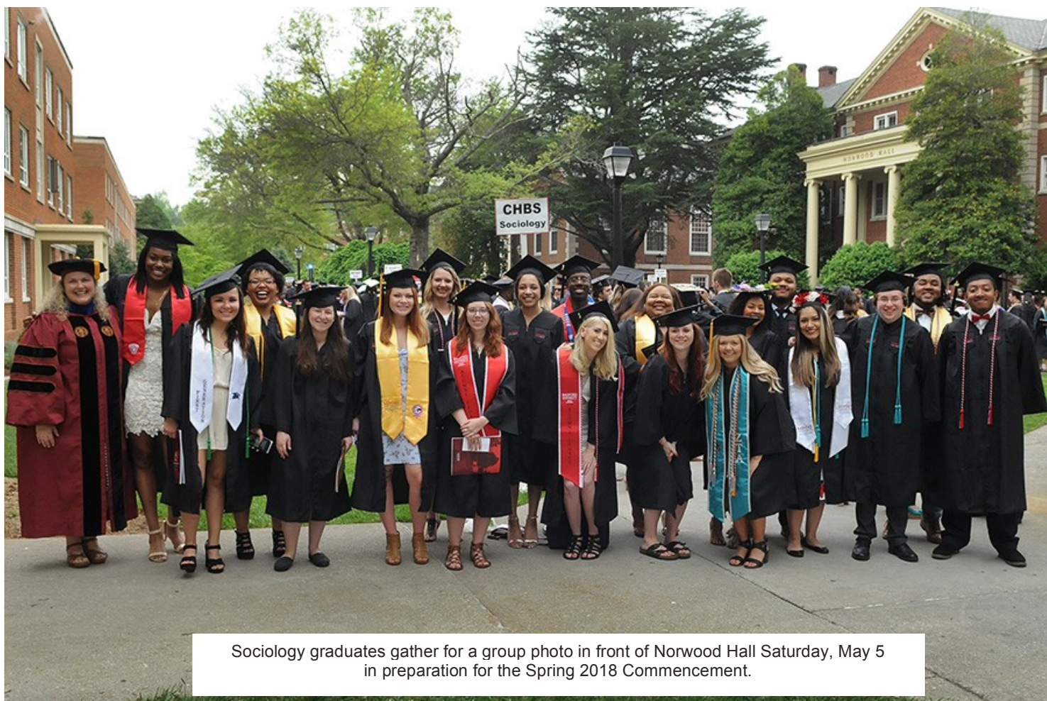
Sociology graduates gather for a group photo in front of Norwood Hall Saturday, May 5 in preparation for the Spring 2018 Commencement.