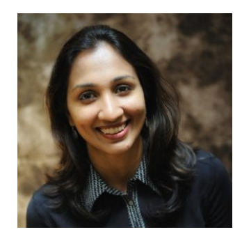
2015 Career Development Conference Keynote