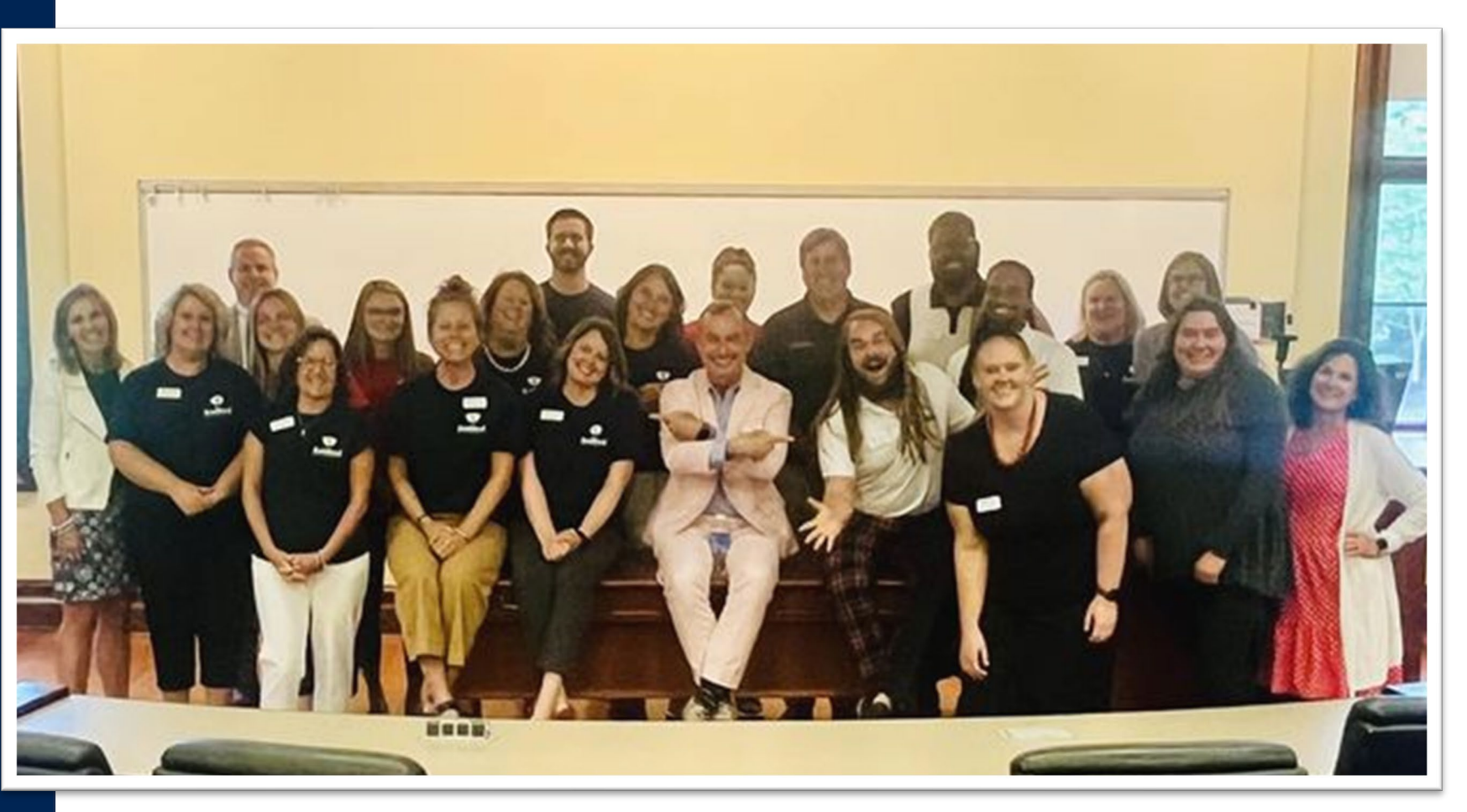
August 16, 2024