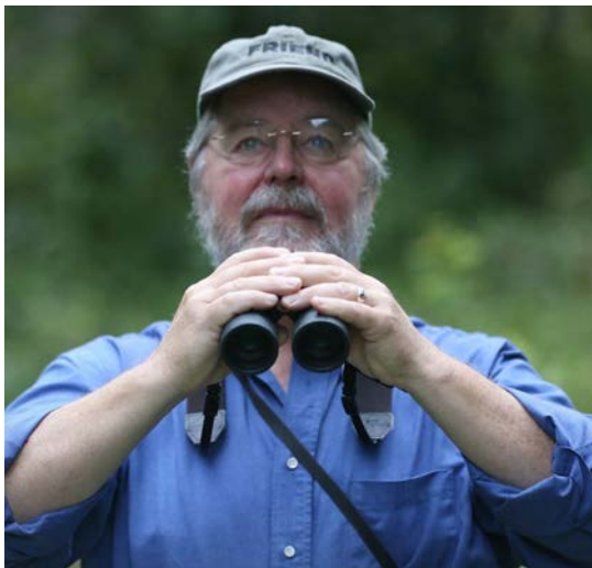
BIOL 231: Genetics