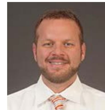
CHEM 301: Organic Chemistry I CHEM 302: Organic Chemistry II