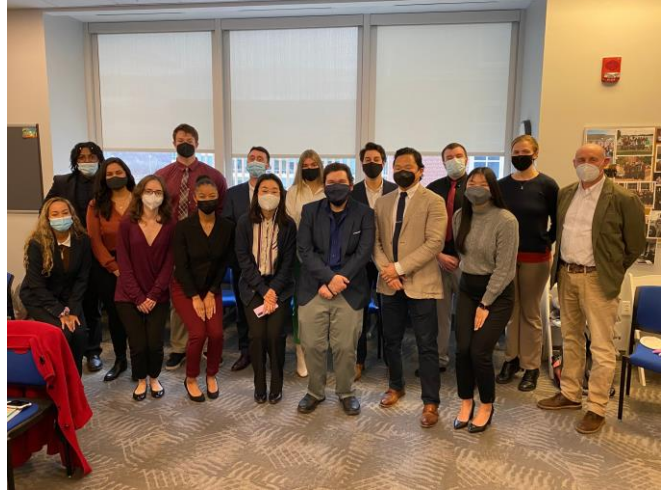
Industrial-Organizational Psychology faculty and students gathered to celebrate the opening of "The Work Place" in Hemphill Hall.

We've also collaborated on processes for selecting internal leadership positions in the Criminal Justice and Philosophy and Religious Studies programs. Beyond our college, I have served as a member of the following university-level searches: